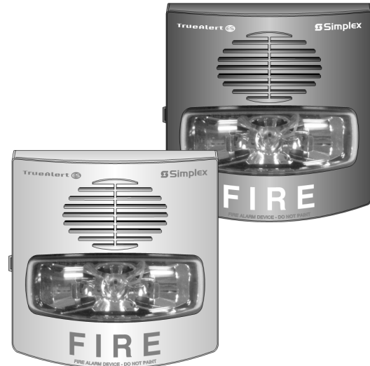
Figure 1: TrueAlert ES Addressable A/Vs are available in red with white lettering and white with red lettering